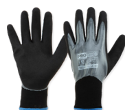
PROSENSE TOUCH SCREEN SAND GRIP WINTER GLOVES